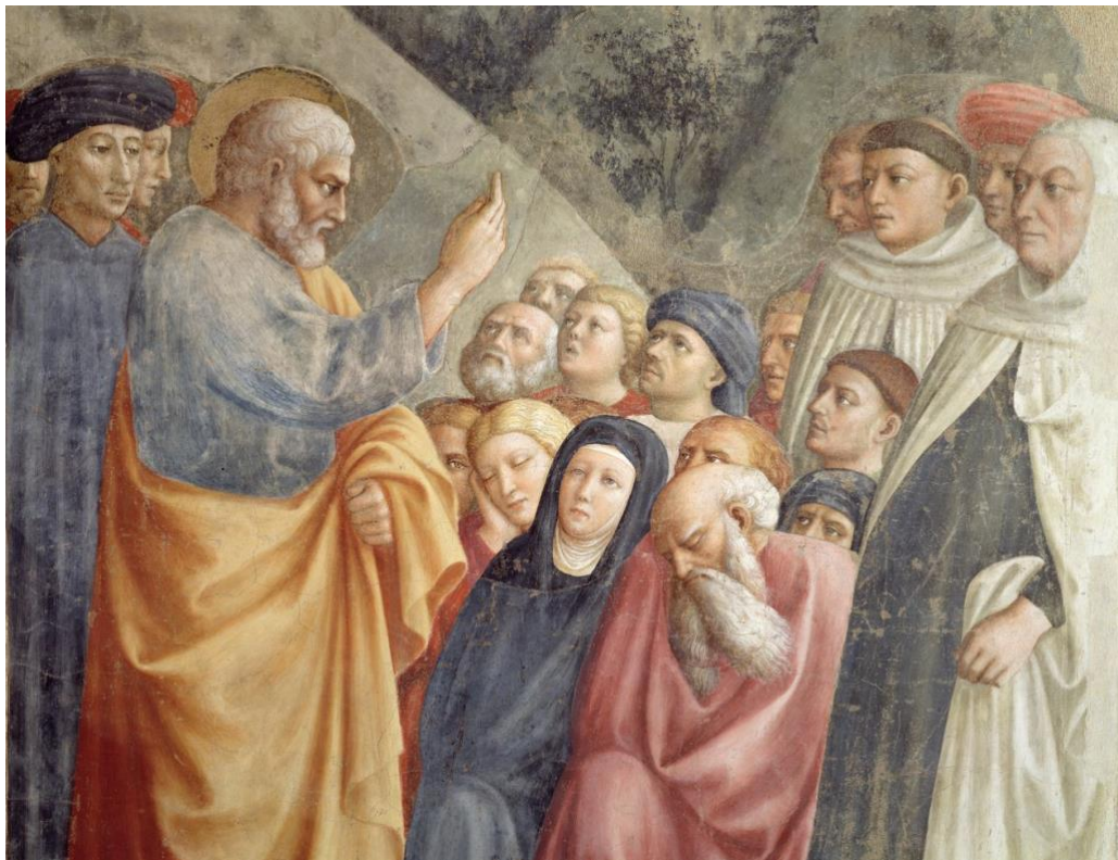
Tommaso Masolino da Panicale St. Peter Preaching in Jerusalem (detail) c.1427 fresco S. Maria del Carmine, Florence