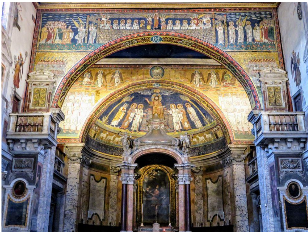
Mosaic of the Second Coming of Christ (9 th century), Basilica of Santa Prassede, Rome