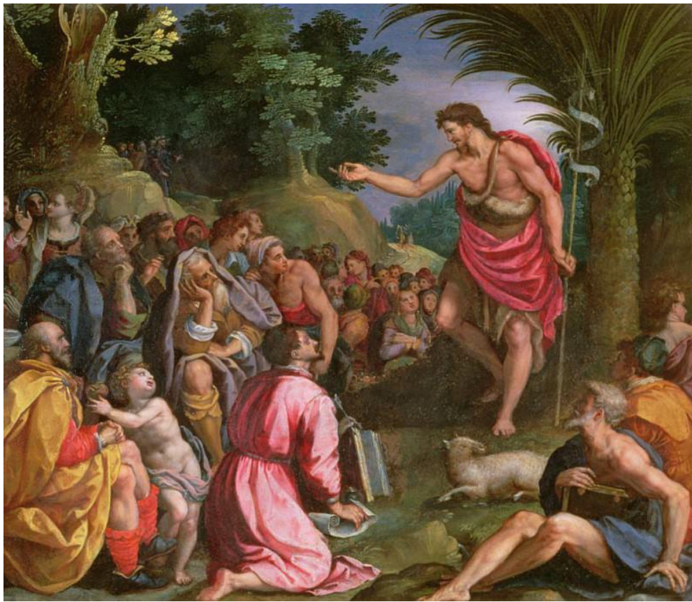
Alessandro Allori The Preaching of St John the Baptist 1601-03 Palazzo Pitti, Florence

Second Sunday of Advent 5 December 2021 Year of St Joseph