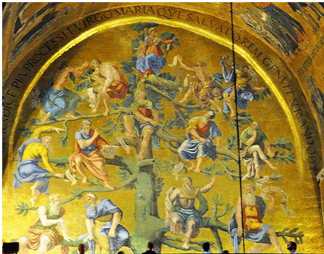
Jesse Tree mosaic, 1548, St Mark's Basilica, Venice

Third Sunday of Advent 12 December 2021 Gaudete Sunday