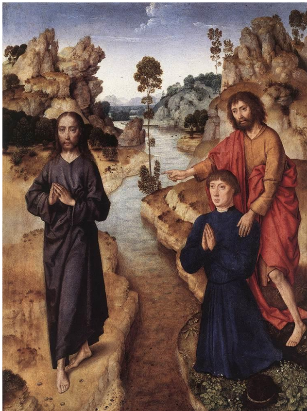
Dieric Bouts Ecce Agnus Dei 1462-64 Alte Pinakothek, Munich