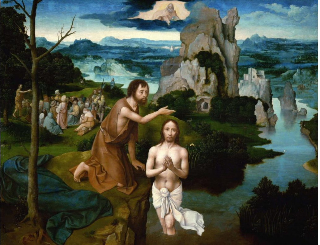
Joachim Patinir The Baptism of Christ 1521-1524 Kunsthistorisches Museum, Vienna