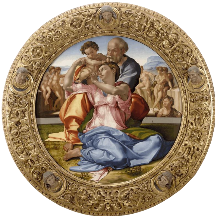
Michelangelo Holy Family 1506 Uffizi Gallery

Feast of the Holy Family 26 December 2021