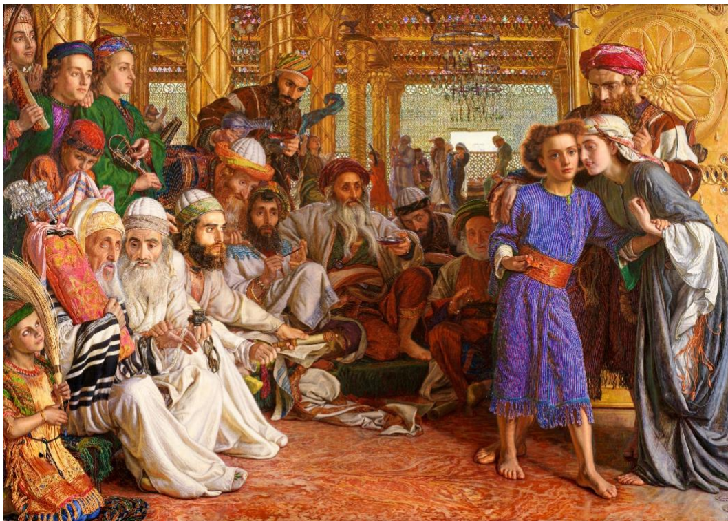
William Holman Hunt The Finding of the Saviour in the Temple 1860 Birmingham Museum & Art Gallery

Feast of the Holy Family 29 December 2024