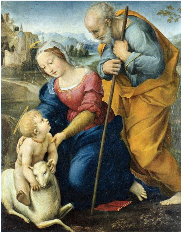
Holy Family by Raphael, 1504, Museo del Prado, Madrid